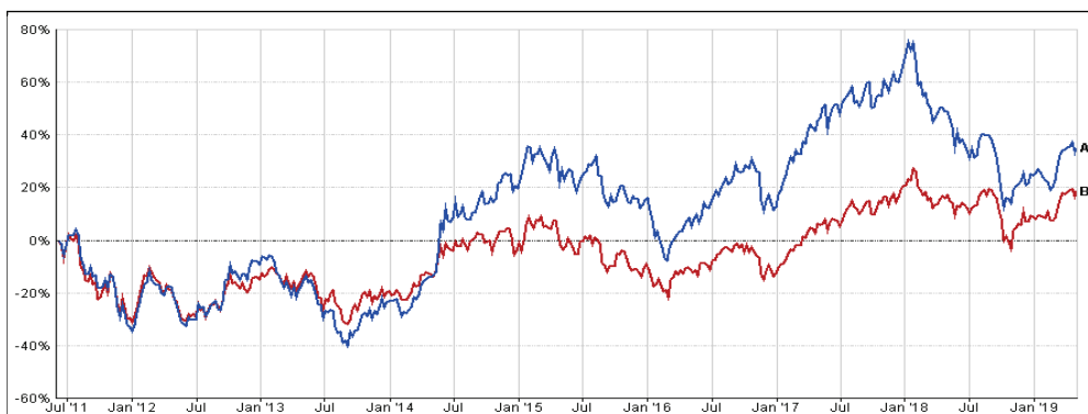
■ A - Reliance-Emergent India B2 NAV in US [35.18%] ■ B - MSCI INDIA NAV in US [18.91%] NAV change (%) NAV line chart (from 07 June 2011 to April 30, 2019), Rebased in US Dollars